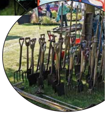
Autumn Plant Fair at Helmingham