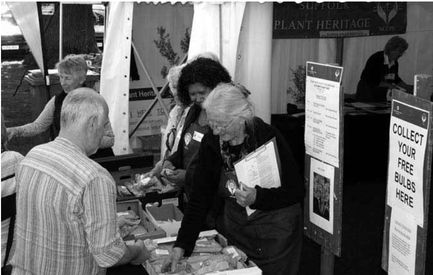
Free bulb collection point at the Autumn Plant Fair