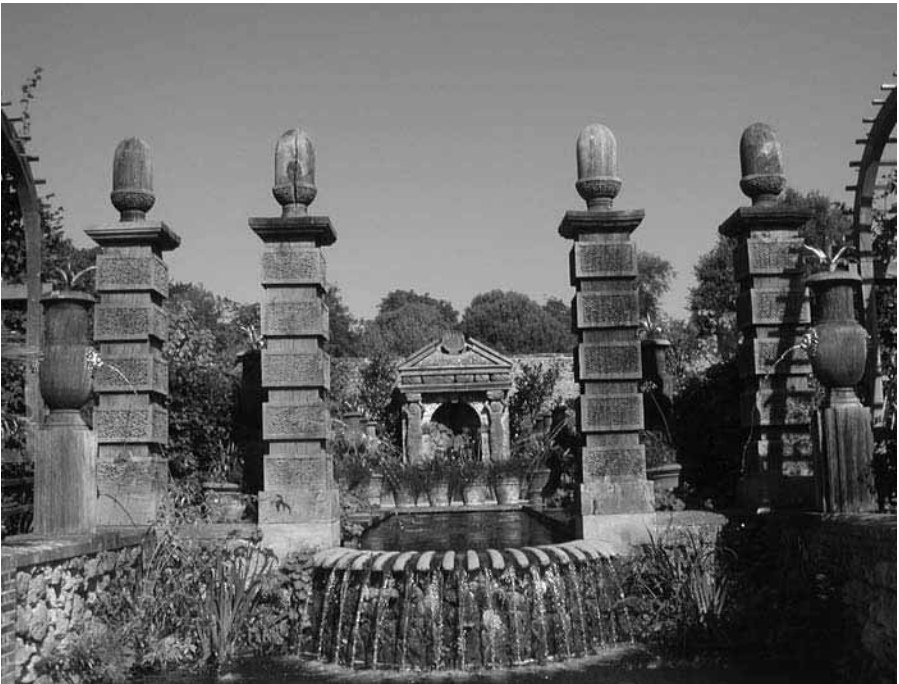
The Collector Earl's Garden at Arundel Castle.

fountains, a canal, a cascade and a domed pergola. There are also pavilions and gateways based on original designs by Inigo Jones. The crowning centrepiece is a rockwork mountain supporting a version of Oberon's Palace, also originally designed by Inigo Jones for a court masque in 1611. The interior is shell lined with a stalagmite fountain on which a gilded coronet dances. All the woodwork is in green oak and topped by acorns.