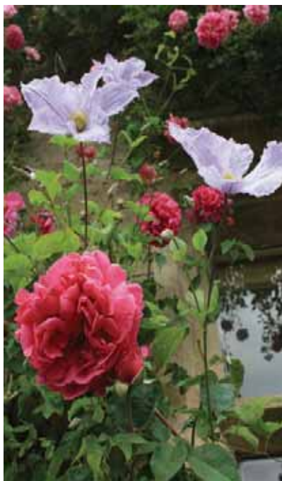
Rosa 'Mme Isaac Pereire' and Clematis 'Blue Angel' (see page 26).