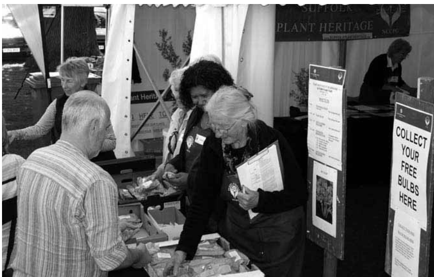
Free bulb collection point at the Autumn Plant Fair